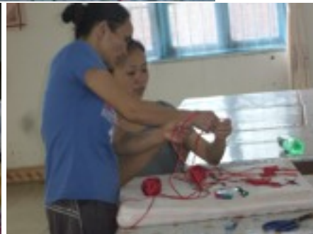
A worker teaching a couple of volunteers how to tie the Chinese knot