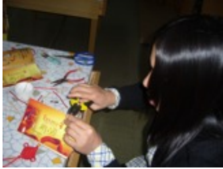
15. Fitting the small calendar