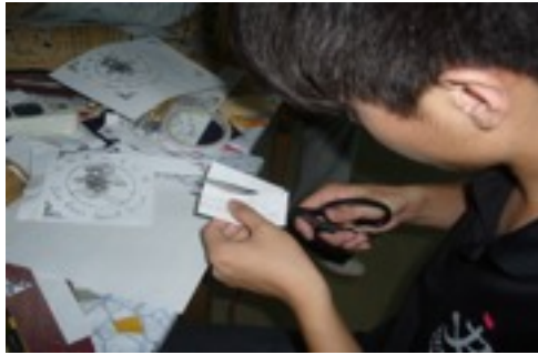
Preparing printing of wordings by a volunteer