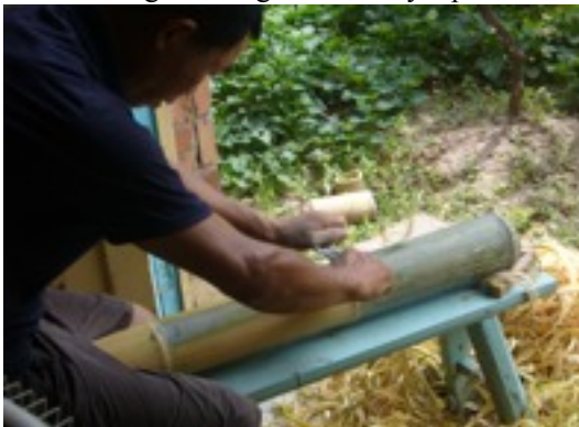
Peeling bamboo skin