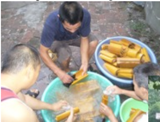
Workers washing the bamboos