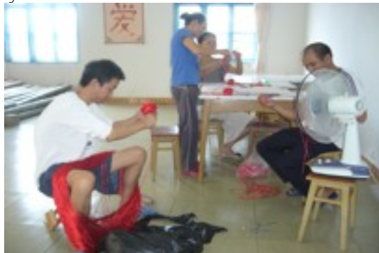
Two workers were busy un-tying the threads used in the Chinese knots