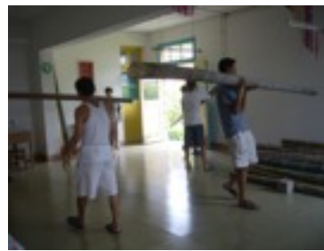
Transportation of bamboo