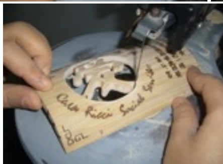
“Love” character trimming