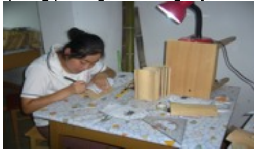
A sister was printing the wordings