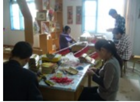
16. Counting the number of finished products