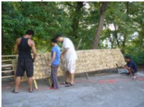
Preparing for the spray