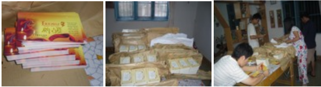
Quality check of the small calendars